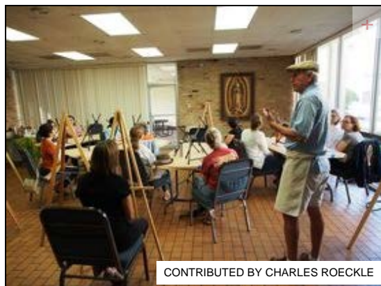
CONTRIBUTED BY CHARLES ROECKLE

Before doors open Dec. 4, there'll be a special pre-play reception, called Vino y Chocolate . The $35 fee includes reserved seating as well as appetizers, drinks and desserts starting at 6 p.m.