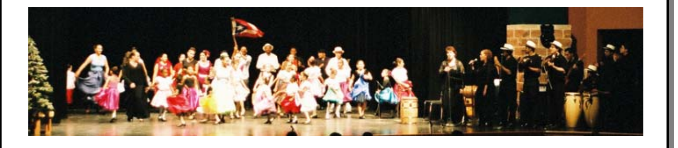
Enjoy these memories!

The performance ended with a sing-along to traditional Puerto Rican Christmas songs as our lively performance culminated in a Parranda!!!